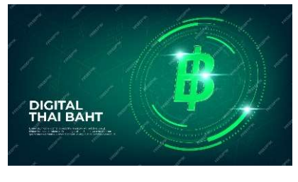
Digital Thai baht: Central Bank Digital Currency (CBDC)